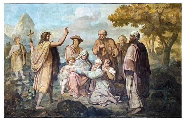
Église Saint-Martin de Castelnau d'Estrétefonds La Prédication de saint Jean-Baptiste par Robert Arsène