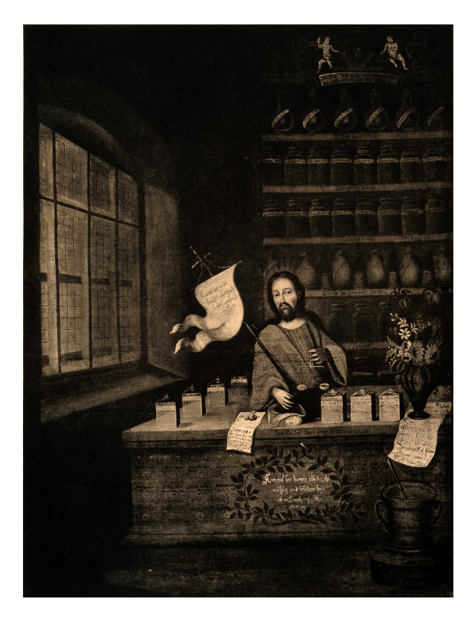
Servons-nous de la Bonne Nouvelle du Christ pour ce que nous sommes.