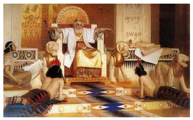
King Solomon, son of David