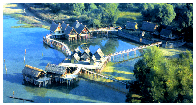
The Neolithic's villages have allowed security.

Before the Neolithic, the human was an animal. We are certainly creatures of God, but we were more violent than animals, so that we later dominate nature.