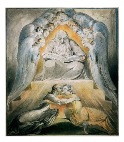
The gospels help to find our truth about life.